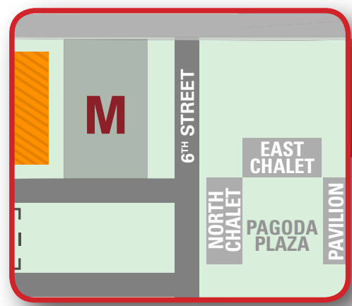
ENLARGED FROM ABOVE